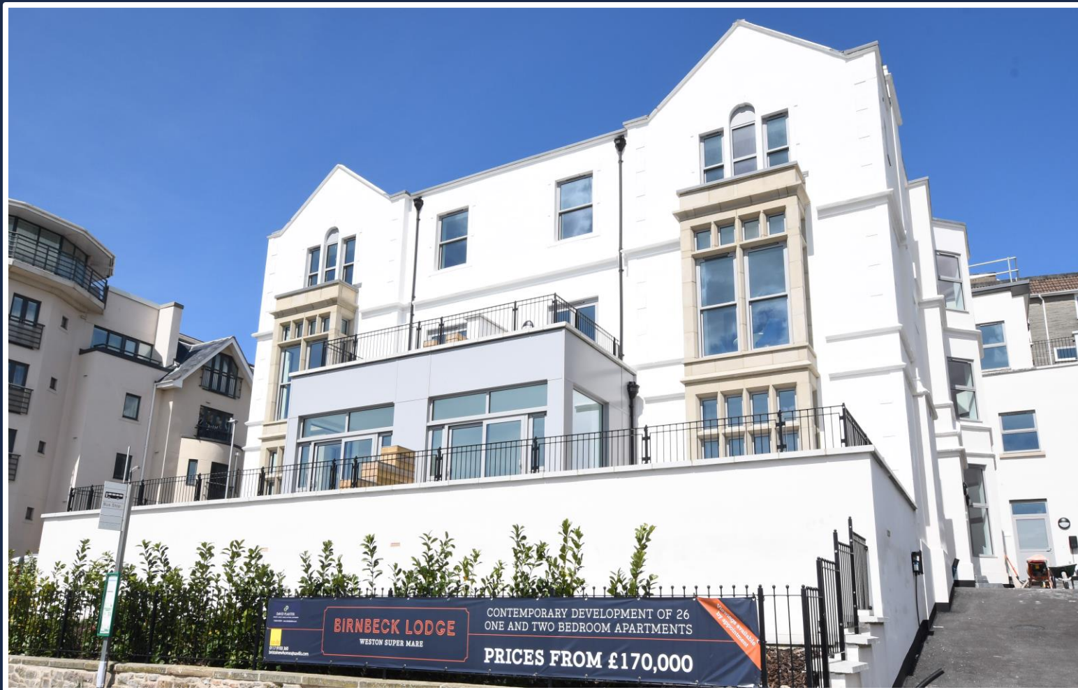
Apartment 4 Rolls Lodge, 2a Paragon Road, Weston-super-Mare, North Somerset, BS23 2DA